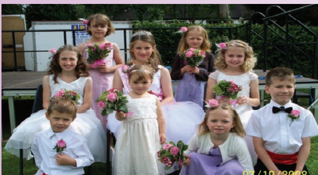
Pictured above: Carnival Queen, Flower Girls and Page Boys who officially opened the event

residents, to the traders and the sponsors and has reinvigorated a sense of community atmosphere and spirit within Ystrad Mynach – I am sure we will continue to make this an annual event that will get bigger and better each year."