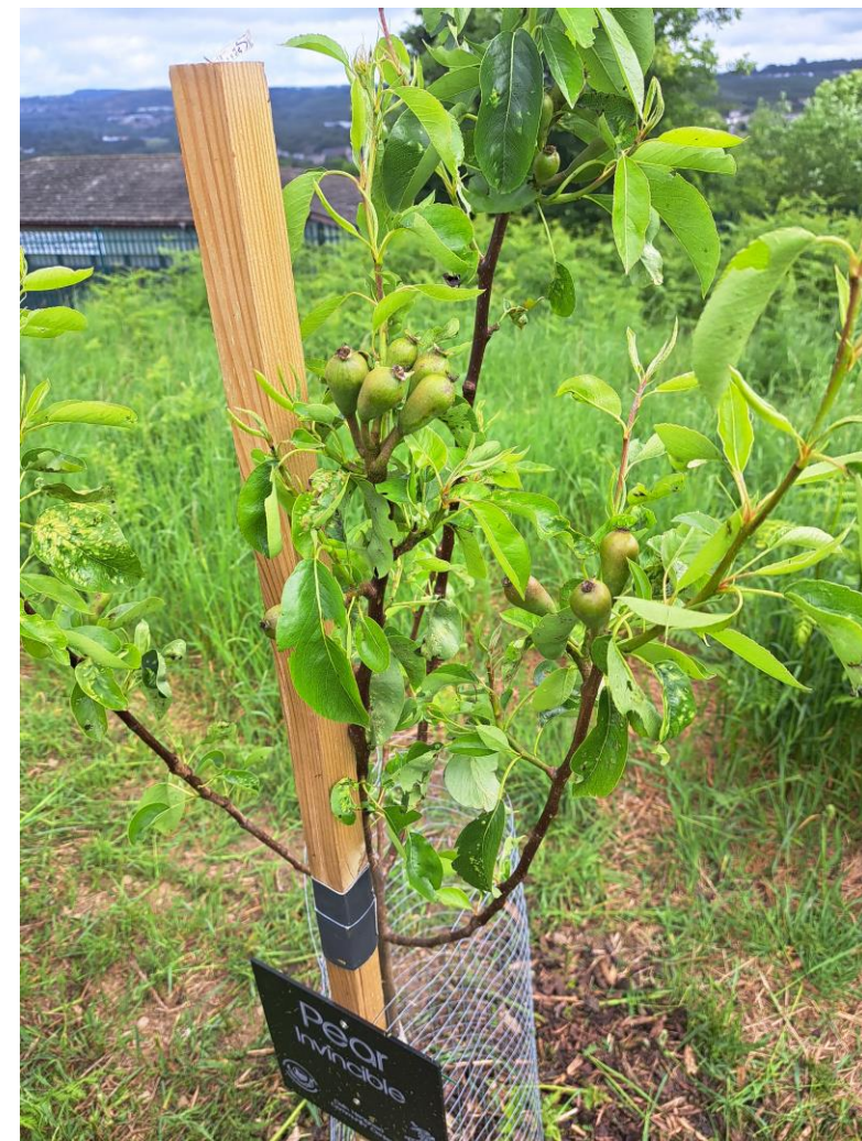
Project 7 Maintenance